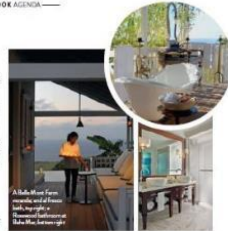
A Bello Meets Farm veranda, and at Bello Meets Farm, top right: a Rosewood bathroom at Baha Mar, bottom right